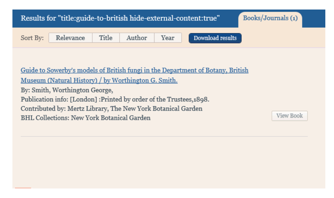
Figure 6: Search results excluding external content