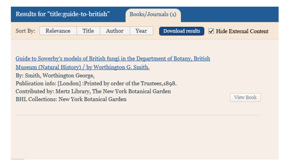
Figure 8: Search results without external content. The "Hide External Content" checkbox has been checked.