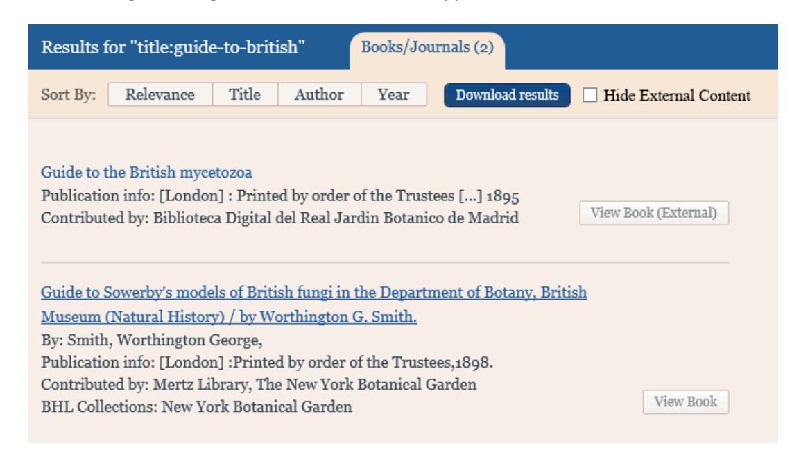
Figure 7: Search results, including external content. Notice the "Hide External Content" checkbox at the top.

The following two images demonstrate what this approach would look like.