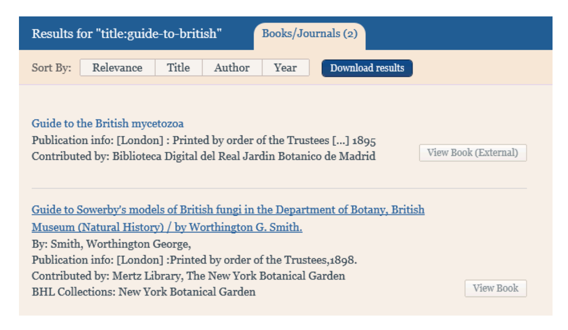
Figure 5: Search results showing external content

Checking the "Hide External Content" checkbox when performing an Advanced Search operation prevents external content from appearing in search results. The next two images show the results of a search with and without external content filtering enabled.