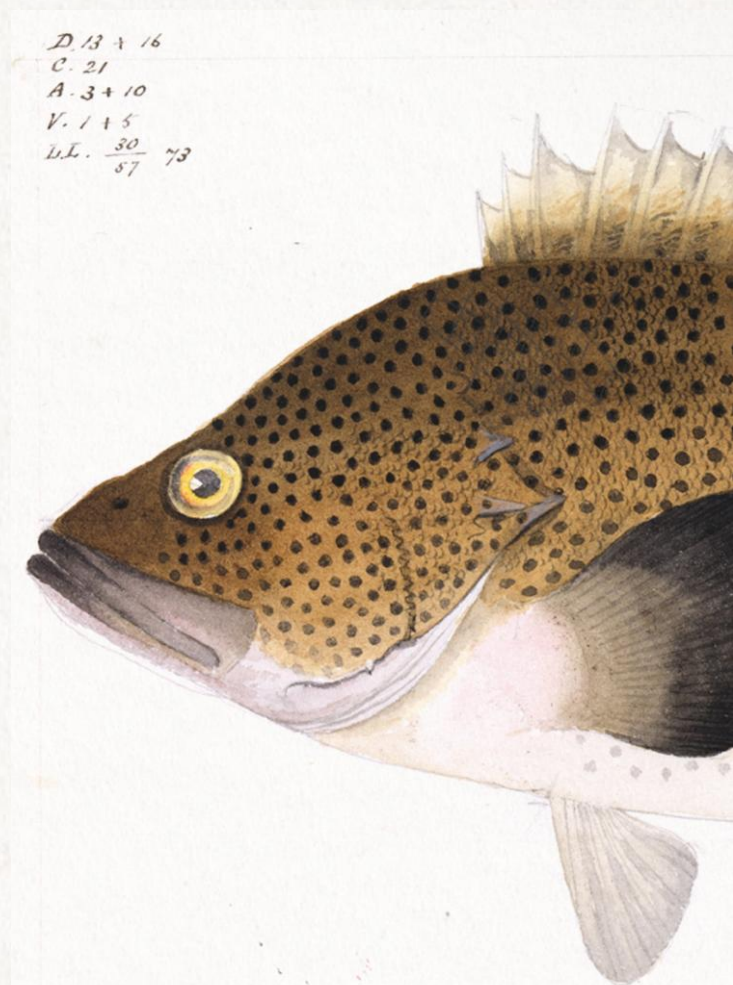
Eastern Wirra, Acanthistius ocellatus, from Prodromus of the Zoology of Victoria by Frederick McCoy.