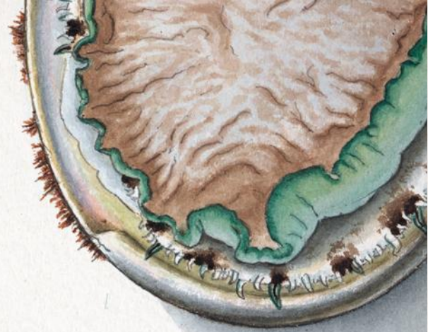
Green-lipped Abalone, Haliotis laevis, from Prodromus of the Zoology of Victoria by Frederick McCoy. Copyright expired: / Artist: John James Wild