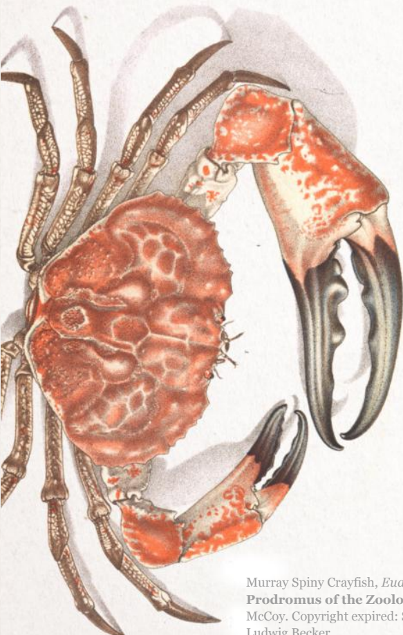
Murray Spiny Crayfish, Euastacus armatus , from Prodromus of the Zoology of Victoria by Frederick McCoy. Copyright expired: Source: Museum Victoria / Artist: Ludwig Becker